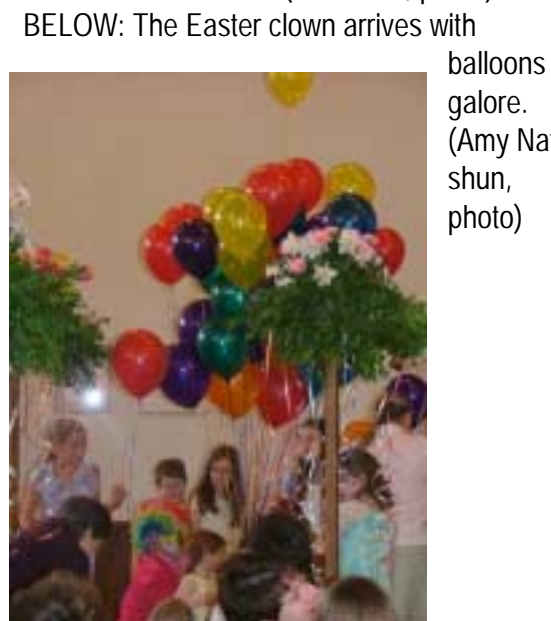
BELOW: The Easter clown arrives with balloons galore.